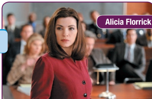
Alicia Florrick from The Good Wife

My favourite is Alicia Florrick from The Good Wife. She's a lawyer.