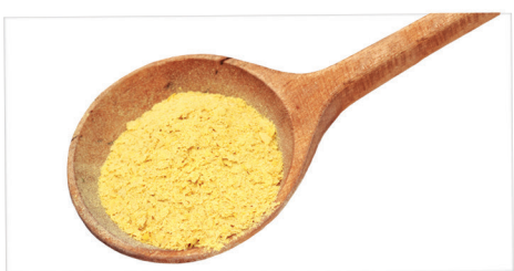
Yeast makes the bread rise.