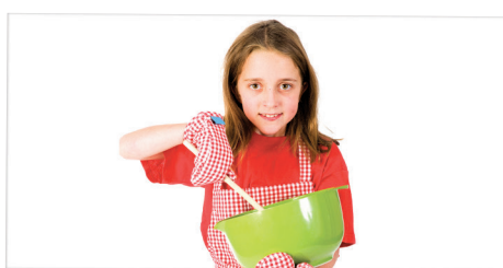
She's mixing the ingredients.