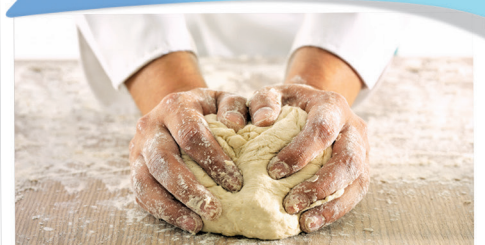
He's kneading the dough with his hands.